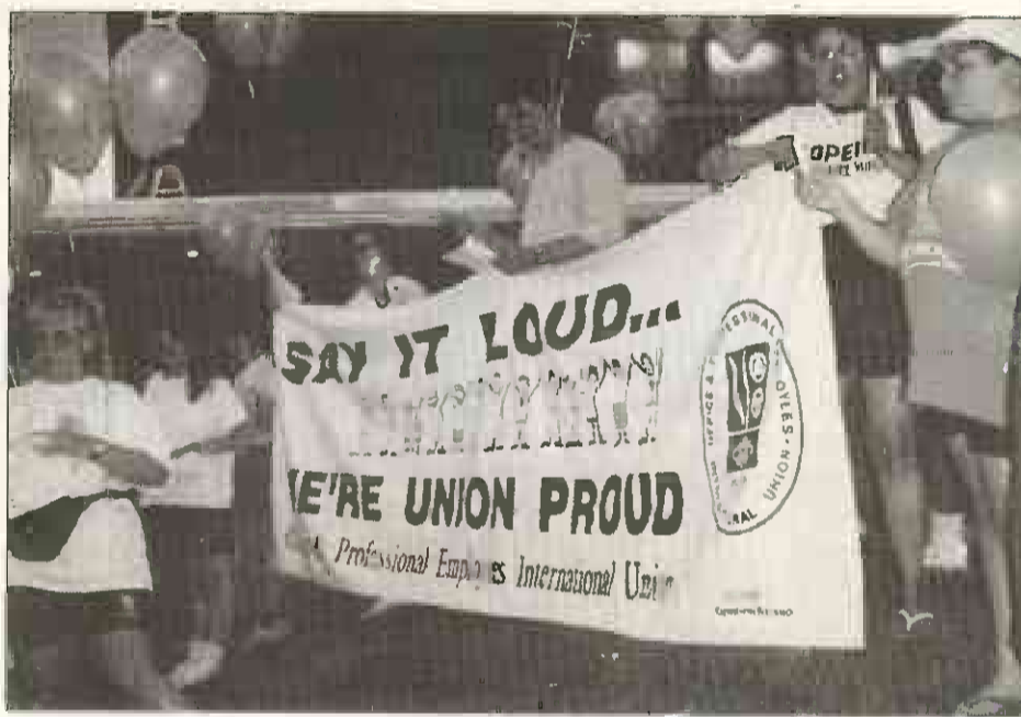
The candlelight vigil.