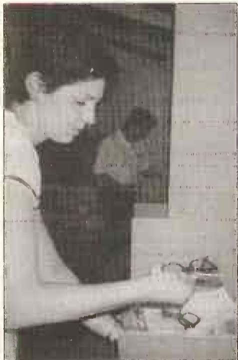
A VOSH volunteer sorts and categorizes donated eyeglasses.