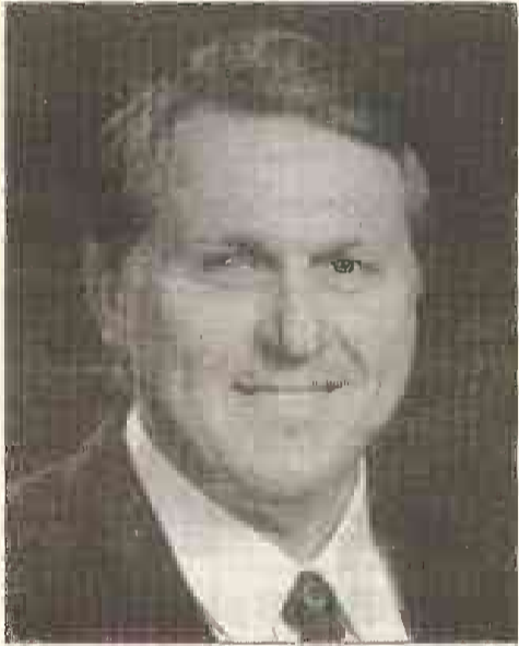
James P. Hoffa

More than two decades since his famous father ran the union, James P. Hoffa has been elected president of the International Brotherhood of Teamsters after winning 54 percent of the vote in a mail ballot contest.