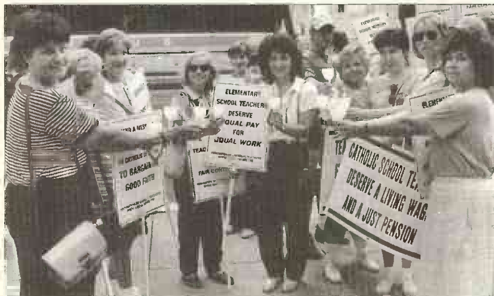
Members of the Federation of Catholic Teachers conduct a demonstration at the Waldorf Astoria hotel in Manhattan.